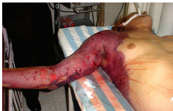
Fig. 5.3: Gas gangrene